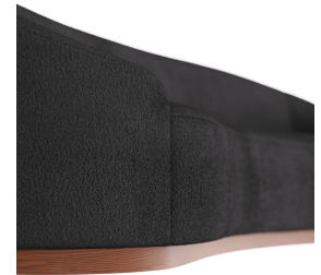
FFU03 TURNER SOFA CHARCOAL SHERPA WHITE OYSTER